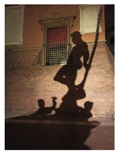
"I'll Always Be With You"