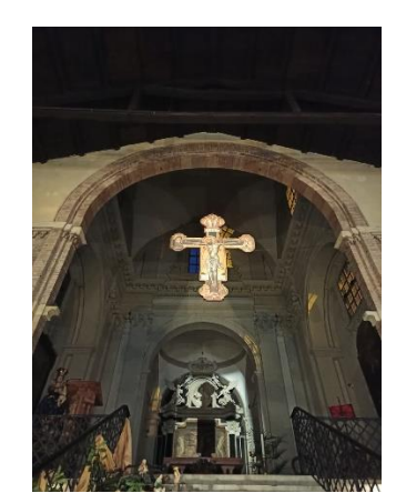
"The Joy Of Spirituality"

words: HOPE, INVOLVEMENT, LOVE, CHANGING and TOUCHING A heartfelt thanks to all the heroes who work with ANT.